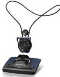
Sennheiser RF 840S or IR 830S

Another alternative for TV use would be a system that is specifically made for television hookups. Such devices are plugged into the Audio Output jack in back of the TV and broadcast an Infrared signal that sends the sound silently to a receiving neck loop. The difference between the IR (infra red) or RF (radio frequency) style is that the RF feature allows you to listen from a different room, through the walls and at larger distances. For IR system they start at $152.00 and RF systems start at $379.00 for. Additional neck loops are also available at an additional cost.