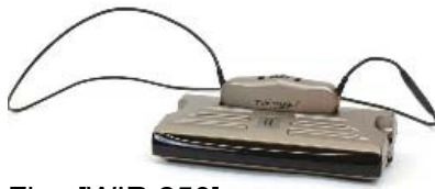
Flex [WIR 250]